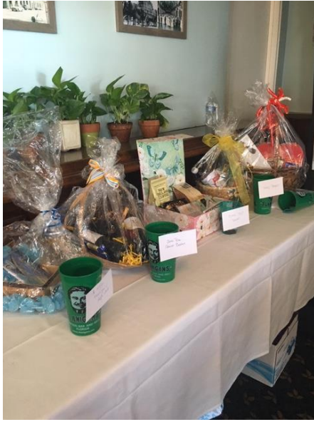
One of the Basket tables